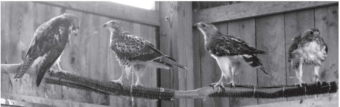
Red-tailed Hawks in flight building for pre-release conditioning