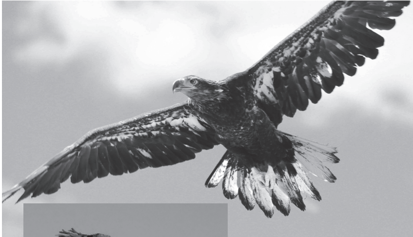
Juvenile Bald Eagle Release