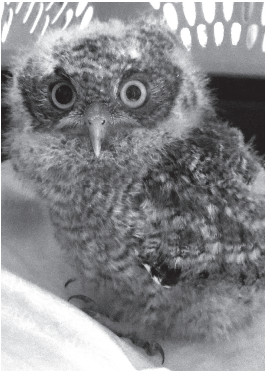
Screech Owlet before being reunited with its family

This course will teach you when to intervene and when not to, and how to capture, stabilize and transport injured birds. Participants have gone on to become dispatchers, transporters, onsite volunteers and board members, in addition to learning how to respond when they find wildlife in need. The class will run for three weeks: Tuesdays February 18, 25 and March 4 from 6:30-8:30pm in Edinboro. Plan to attend all three classes. Cost is $25 and includes a workbook. Registration information will be available on the website, or call the center (814-763-2574). Previous participants are welcome to attend for review at no cost, but should register.