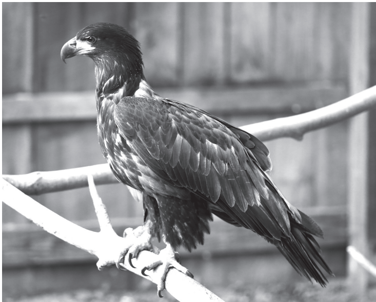
Female Eaglet from blown-down nest