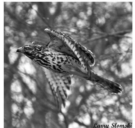
Red-shouldered Hawk release