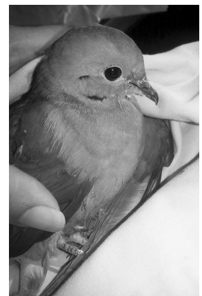
Morning Dove with frostbitten toes. Later released!