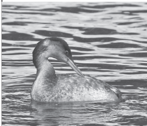
Red-necked Grebe release

By the end of February, Lake Erie was 98% frozen over, creating difficulty for water birds. Many flew south in search of food and open water, and ran into trouble along the way. Tamarack was there to help. This winter we treated seven different species of water birds and released all but one. Water birds require specialized care to provide an appropriate (often expensive!) diet for each species and especially to maintain proper water proofing of their feathers. This was the first year Tamarack has treated Canvasback, Greater and Lesser Scaup, and Long-tailed Duck.