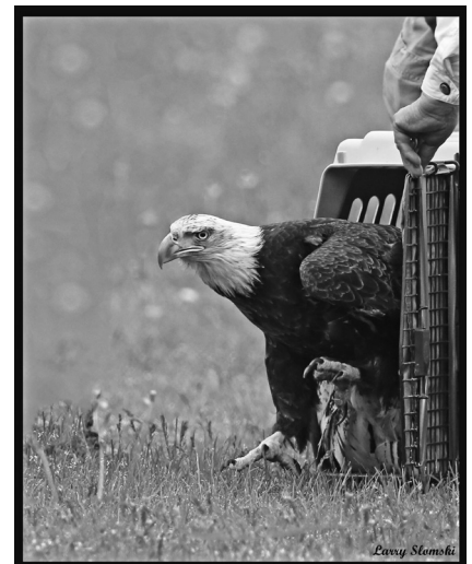
Release of female Bald Eagle.