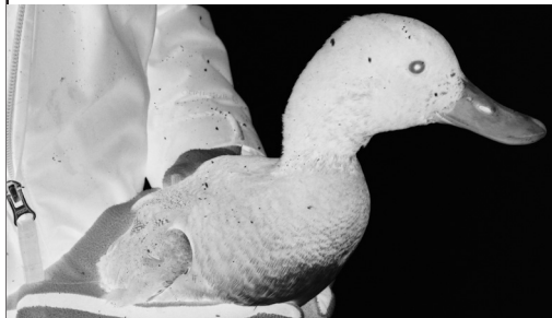
Release of Lesser Scaup