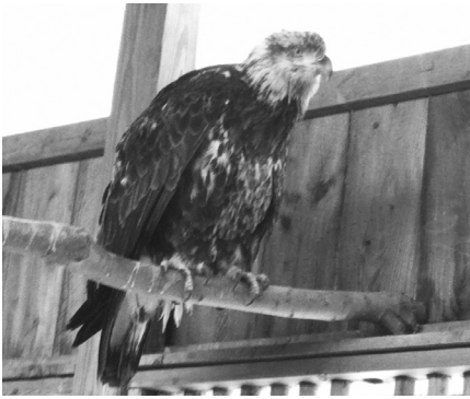
Juvenile Bald Eagle

It's been a long hard winter for humans and wildlife alike. But at this writing, the sun is shining, there is a warm breeze and the seasons are clearly turning. Wildlife are staking out territories and starting families or migrating to their summer breeding grounds. We know soon the center will be bursting at the seams with new patients to be cared for. Our first baby of the year has already been admitted: a Great Horned Owl nestling. Another of our current patients is an enormous twelve pound (5.5 kg) female Bald Eagle with a wing fracture.