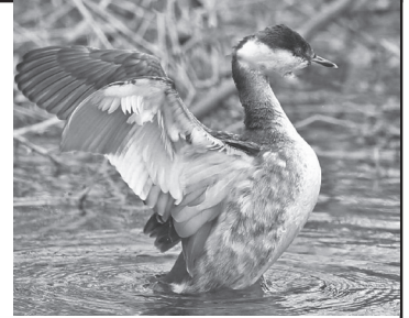
Horned Grebe release