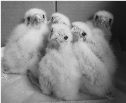
Nestling America Kestrels raised at Tamarack.