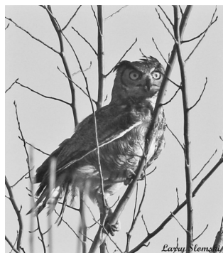
Great Horned Owl release

There are all kinds of reasons that many forests in Pennsylvania are in rough shape, from a legacy of past overharvesting to ongoing problems with deer overbrowsing and invasive plants and insects. Although your woods may look great to you, forest bird species may be telling you otherwise by not being there! In fact populations of some forest bird species like the Eastern Wood pewee have been declining for decades, indicating that our forests are not in as good shape as they could be.