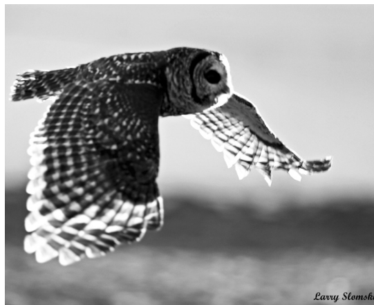
Going home! Barred Owl release