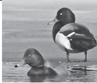
Greater Scaup release