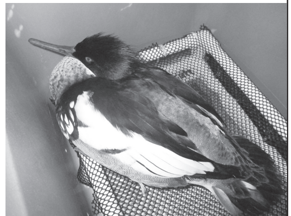
Red-breasted Merganser later released