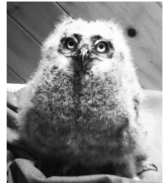
Great Horned Owl Nestling

It's been a long hard winter for humans and wildlife alike. But at this writing, the sun is shining, there is a warm breeze and the seasons are clearly turning. Wildlife are staking out territories and starting families or migrating to their summer breeding grounds. We know soon the center will be bursting at the seams with new patients to be cared for. Our first baby of the year has already been admitted: a Great Horned Owl nestling. Another of our current patients is an enormous twelve pound (5.5 kg) female Bald Eagle with a wing fracture.