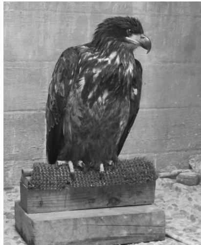
Juvenile Bald Eagle