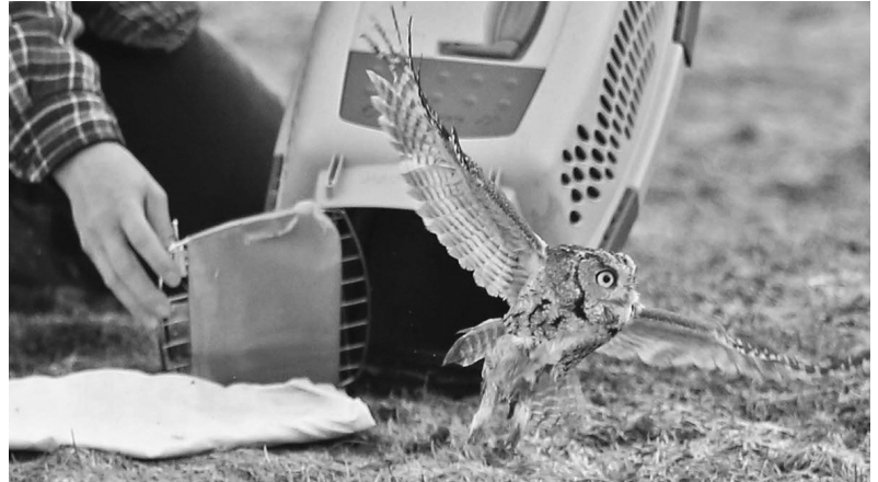
Eastern Screech Owl returns home