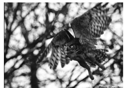
Great Horned Owl release