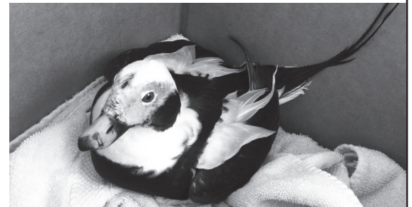
Long-Tailed Duck in treatment