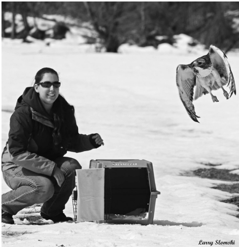
Red-tailed Hawk release

This winter Tamarack had a full house! Tamarack treated eight different species of raptors: Eastern Screech Owls, Red-tailed Hawks, Red-shouldered Hawk, Turkey Vulture, Barred Owl, Great Horned Owl, Cooper's Hawk and Bald Eagle. This was in addition to the water birds, song birds and two turtles that were over-wintered. Admissions are typically slower during winter months with the result that we usually see fewer raptor species, often just half as many as this year! Since many of these birds were admitted with low body weight as well as injuries, these patients were housed at the Center until spring finally brought easier hunting conditions. Every available space was filled since most species cannot be co-housed with others. Then it was time for release!