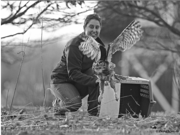
Release of Great Horned Owl