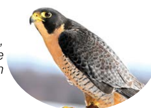
Apollo, Peregrine Falcon

Name of Sponsor: _____ Gift Recipient's Name: _____