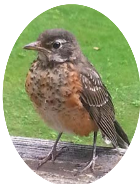
American Robin raised from nestling and released

Go to AmazonSmile.com and look up Tamarack Wildlife Center's wish list for more great ideas!