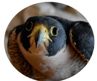
Apollo, Peregrine Falcon