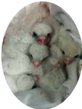
Nestling American Kestrels, raised at the Center and released.